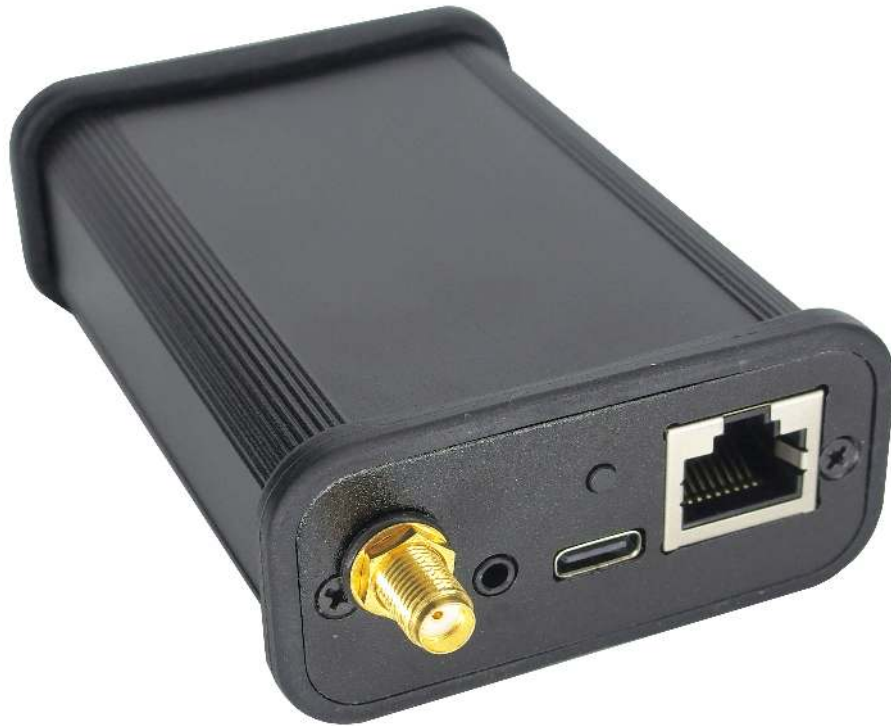
Figure 2: USB side of icE1usb

From left to right, there are the following connectors: