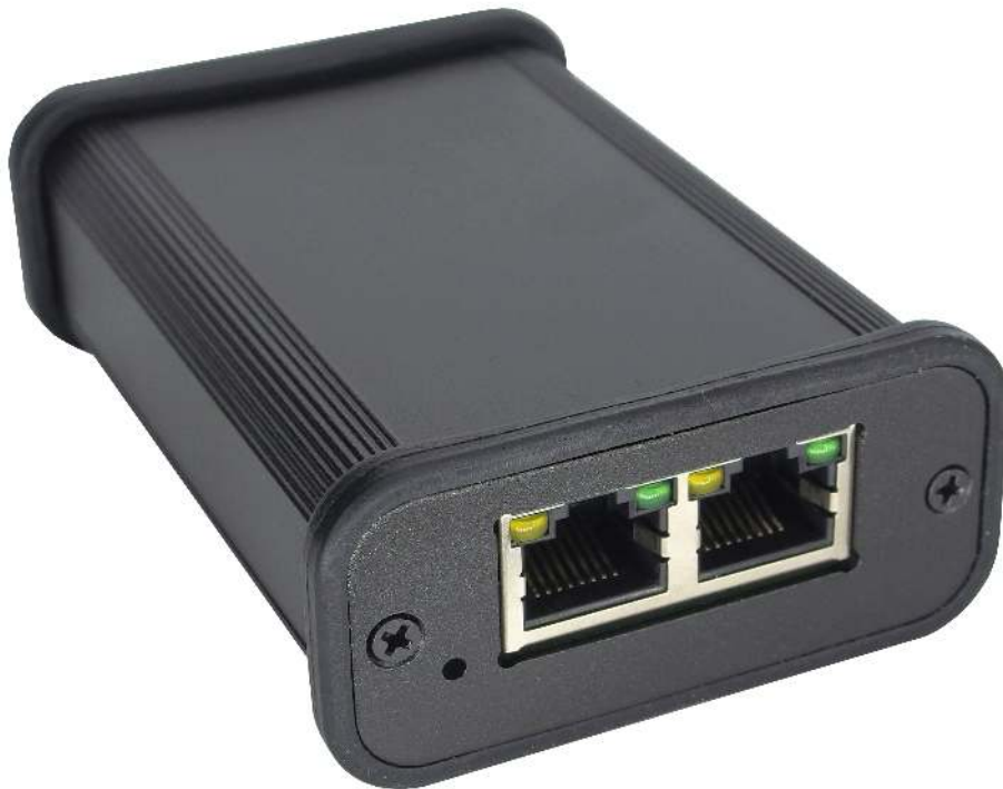
Figure 1: E1 side of icE1usb

From left to right, there are the following connectors: