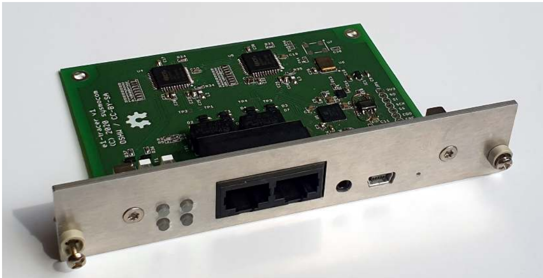
Figure 1: e1-tracer BGT variant

The e1-tracer Hardware consists of a single circuit board, mechanically either assembled into a desktop enclosure (KOH variant) or into a 3U component carrier module (BGT variant).